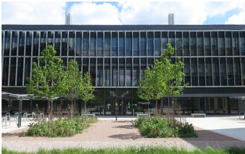
Photo: Civil Engineering Building, University of Cambridge